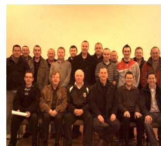
The St Michaels GAC Committee for 2010. Good luck and many successes for the future.

Good luck and many successes for the coming year!!